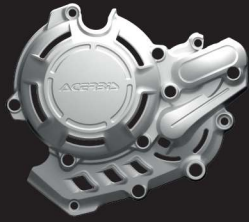
A - (1 pcs)