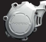
B - (1 pcs)