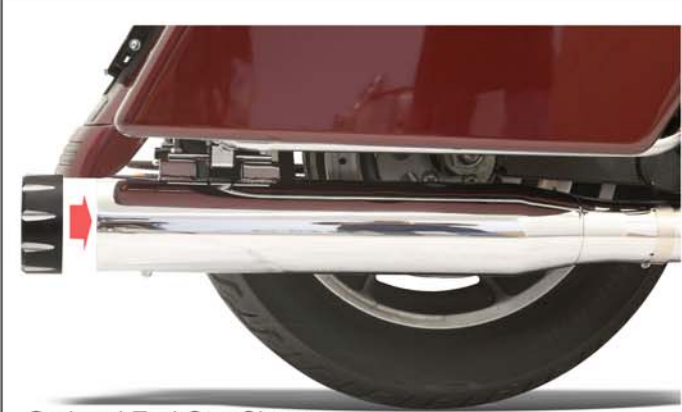
Optional End Cap Shown

CAUTION: WRAPPING of Pipe with Heat Tape may adversely affect the pipe & will Void Warranty!