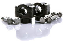
Four Bolt Risers