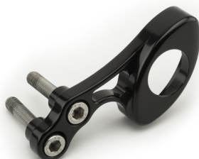
Ignition Relocation Kit