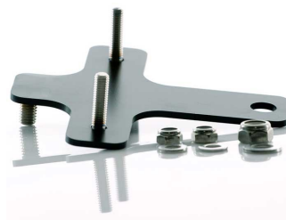
Passenger Peg Block Offs