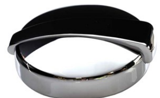
Mock Monza Gas Cap