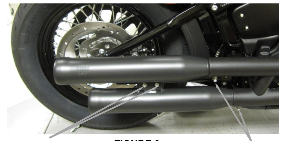
SUPPLIED 1/4" X 3/4"