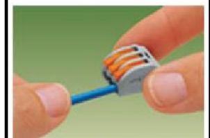
Then push down lever to its closed position.

Questions? Call us at: 1 (800) 382-1388 M-TH 8:30AM-5:30PM / FR 9:30AM-5:30PM EST