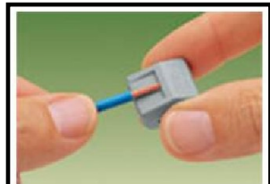
Strip wire 9-10 mm. Use wire gauge on bottom to verify.

Safety: Always follow safe working practices including safety gear and the proper tools. Make sure vehicle is cool enough to touch. Make sure it is secured on a level surface.