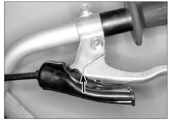
6.1 On some models, clutch freeplay is measured at the lever gap (see this Chapter's Specifications) . . .

nut and turn the adjuster to change freeplay.3 Some models are equipped with a mid-