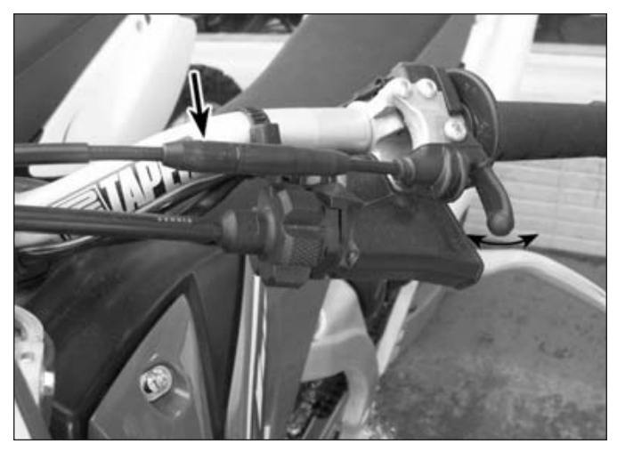
5.14a Measure freeplay of the hot start lever at the lever tip slide back the cover (arrow) for access to the adjuster . . .