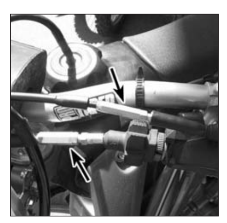
5.14b ... loosen the locknut and turn the adjuster (upper arrow) - the lower adjuster (lower arrow) is for the clutch

2 On early models, pull back the rubber cover from the adjuster at the handlebar (see illustration). Loosen the lockwheel or lock-