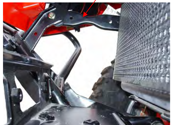
"Figure 4" Contactor Location