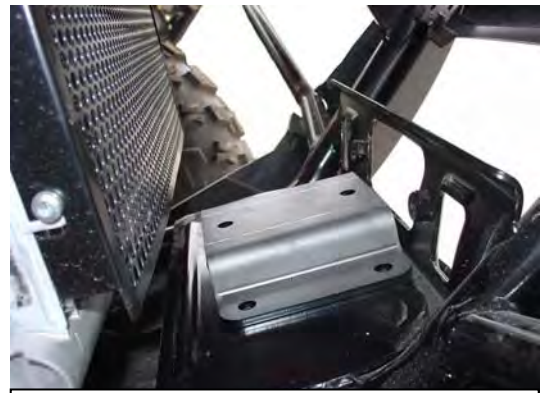
"Figure 2" Mount Location