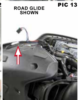
ROAD GLIDE SHOWN