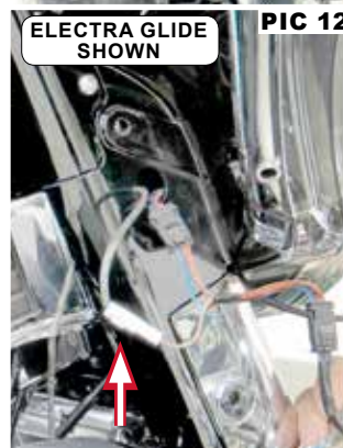
ELECTRA GLIDE SHOWN