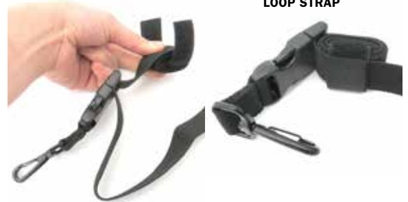
OFF-BIKE VIEW OF STRAPS