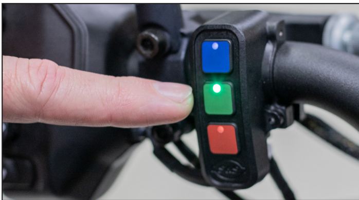
Pressing Green will put the bike into the Standard mode; throttle will have a nice, normal response.