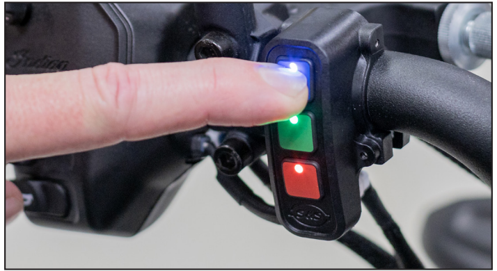
Pressing and holding the top Blue key will cause the LED light level to increase in 10 increments. New light level value is stored in nonvolatile memory.