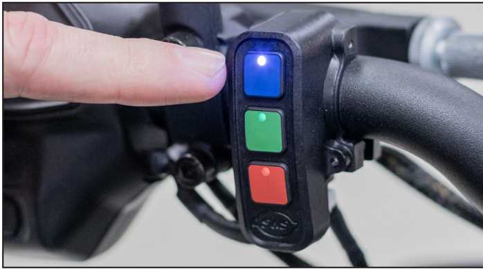
Pressing Blue will put the bike into the Rain mode; throttle will be more limited to prevent quick accelerations.