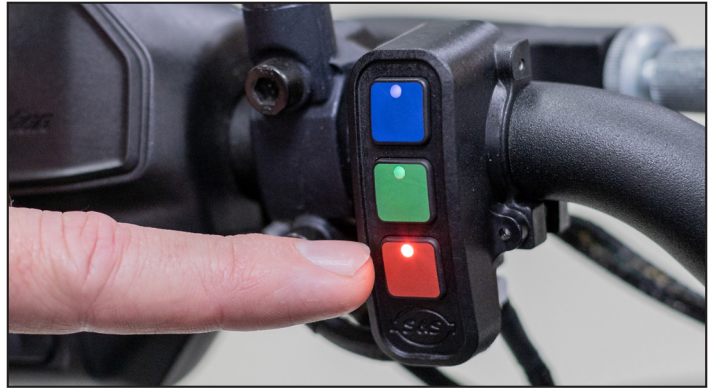
Pressing Red will put the bike into the Sport; throttle will have a very fast response.

Push a button to change the ride mode. The newly selected mode will light when you press the button and when you release it, it will show the current drive mode state. It may take a fraction of a second for the ECM to change modes and at this point the switch lights will update. If all three switch lights start to flash, the mode is unable to change. This can be caused by trying to change modes while at road speed. Letting completely off the throttle and slowing down will allow the ECU to perform the switch.