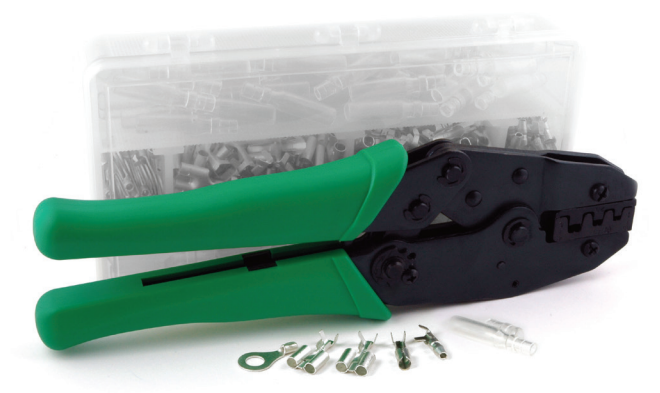
Use a Trail Tech Crimp Kit for a Professional Installation. P/N: HT230C

To wire two lights to turn on and off together, Y-crimp the wires together and hook them up as described above.