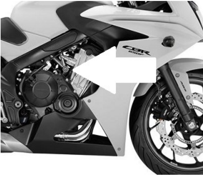
Assembly position (both sides)

year of production: '14- product code: SR119