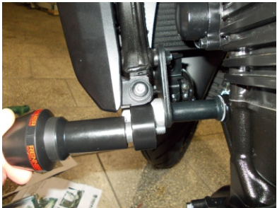
Assembly position (left side)

year of production: '12- product code: SR135