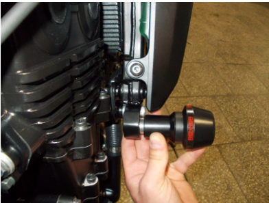
Assembly position (right side)