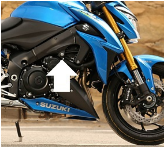
Assembly positions (both sides)