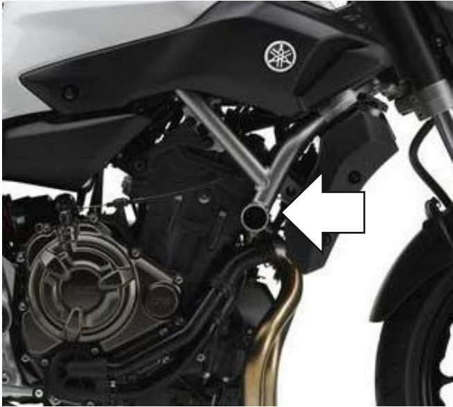
Assembly position (both sides)

year of production: ALL product code: SR184