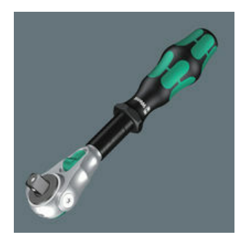
1. Fine-tooth ratchet 2. Flex-head ratchet 3. Angle ratchet 4. Quick-release ratchet 5. Power ratchet 6. Screwdriver