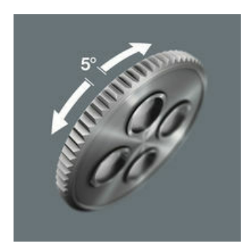
The reversible ratchet with 72 finepitched teeth has a low return angle of only 5°. This short stroke allows fast and precise work in all types of installation.