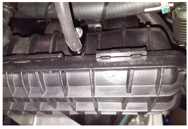
15. Route tubing to fitting, cut it to length and connect it, then secure it away from hot and moving engine components with cable ties (8) .