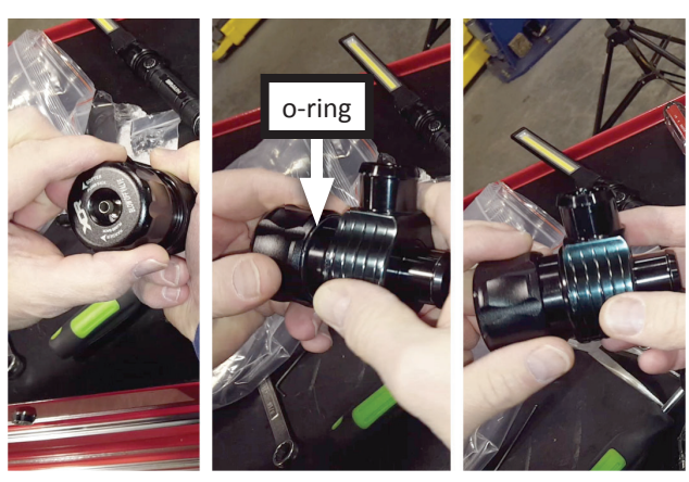
Prepare blow off valve (4) by turning knob fully in "softer" direction. This will expose an o-ring. Now turn knob in "harder" direction until o-ring is covered. This is the softest possible spring pressure setting.