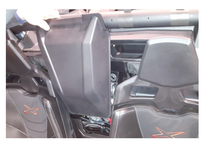
2. Remove console back cover from vehicle.