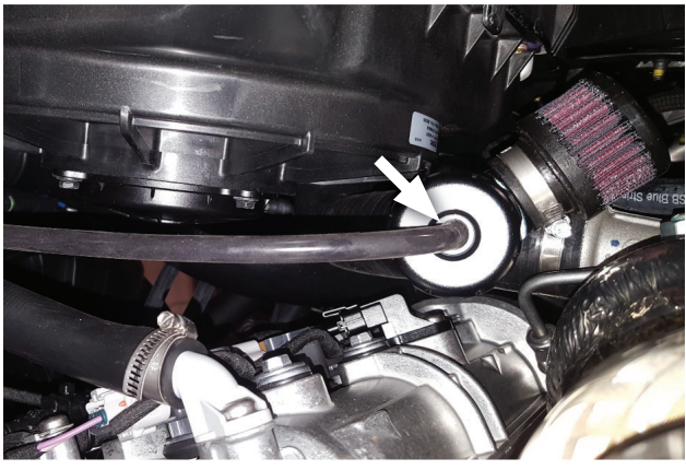
12. Connect tubing (7) to blow off valve knob and route its other end over to the intake.