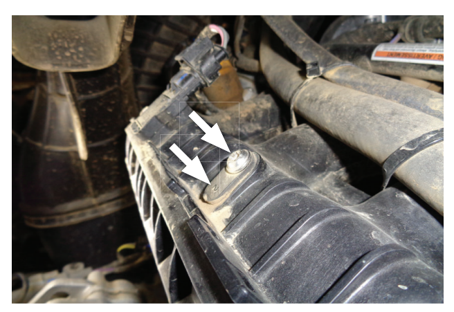
13. Remove factory screw and mount from intake. Retain screw for later use.