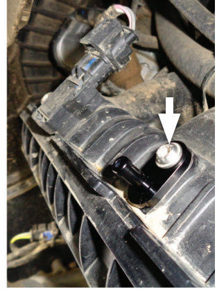
14. Install o-ring (6) on fitting (3) then press fitting into intake. Set fitting mount (2) over fitting (indent facing down) and secure assembly using screw (removed step 13).