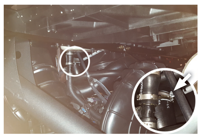
NOTE: Complete this step by accessing vehicle from driver side rear corner.

Loosen clamp indicated connecting air tube to intercooler.