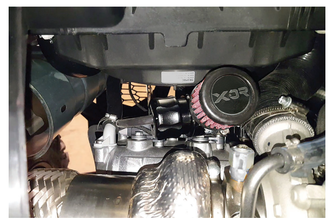
16. Verify all component connections are secure then adjust valve. You may wish to remove breather filter during adjustment to see valve.

VALVE ADJUSTMENT NOTE: The valve should stay closed as you idle and as you accelerate. It should only open as you take your foot off the gas pedal to deccelerate.