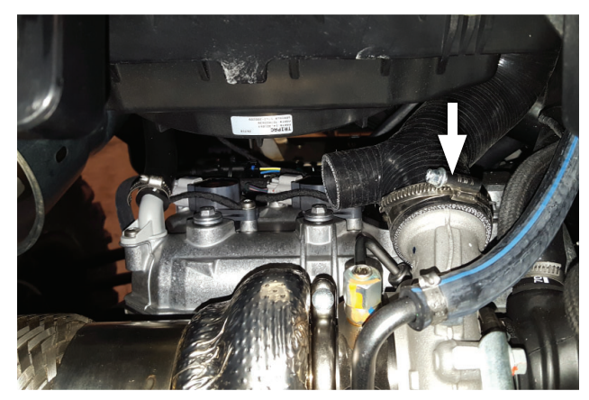
Connect other end of air tube to turbo then move clamp over connection. Press air tube on fully, make sure both ends are seated properly then tighten all clamps.