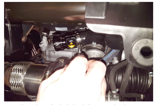
10. Place clamp (included in kit) on air tube then install blow off valve as shown. Tighten clamp to secure connection.