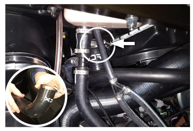
7. Place clamp (removed step 6) onto air tube (1) then connect it to intercooler.