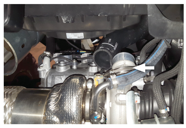
4. Move clamp onto turbo to retain it for later then disconnect air tube.