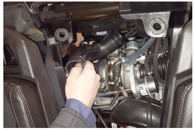
6. Remove air tube from vehicle and retain clamp for later use.