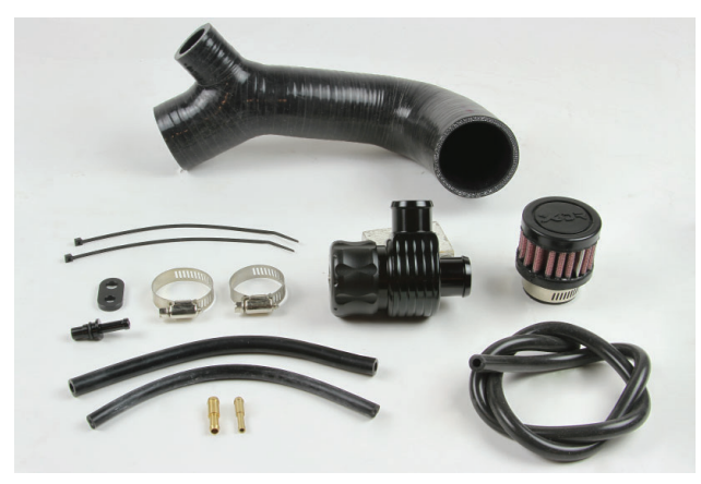
Please take a moment to read and understand these instructions before installing your Flowmaster performance system.

NOTE: Please inventory all parts before starting the installation process and call our tech line to report any missing parts. This will help avoid potentially stranding your vehicle until any missing replacement parts arrive.