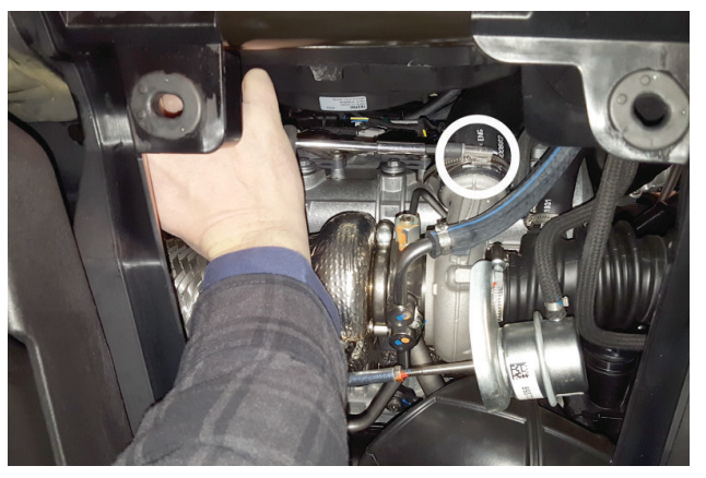
3. Loosen clamp fastening air tube to turbo.