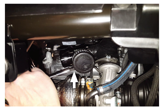
11. Install breather filter (5) into blow off valve as shown. Tighten clamp to secure connection.