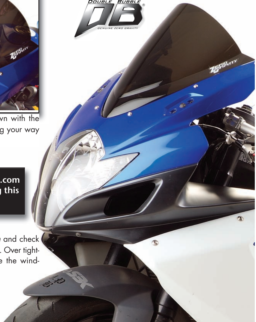
Fig 10. Be sure to not over tighten and check that all screws or bolts are securely fastened. Over tightening may crack your fairing or damage the windscreen.

Please see www.zerogravity-racing.com for further information concerning this product.