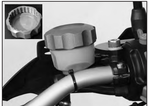
ZCap, Brake Reservoir Replacement Cap, Machined Aluminum Fits: R1200 GS/F

BMW TOOL REQUIRED BMW Tool, 321 510/511 Clutch Reservoir and Brake Reservoir Cap removal tool.